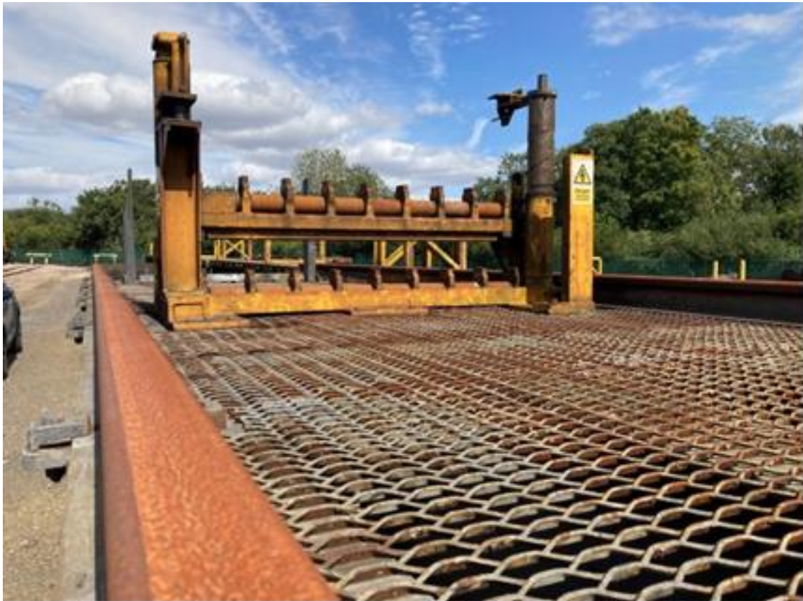
Diagram 3 – Modified End Roller Bank for Rail End Restraint

This bulletin is valid UFN from date of issue.