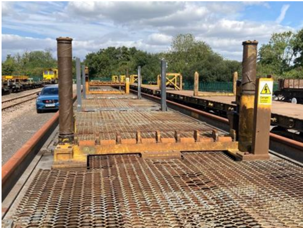
Diagram 1 - Modified Single Tier Roller Bank

This is in conjunction with Loading Pattern 4.5 (published in Safety Central 'Infrastructure Loading Patterns')